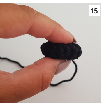
Embroider the eyes using Catania Grande in Schwarz.